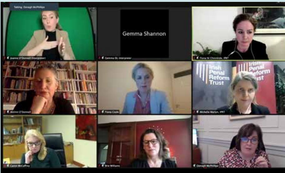
4 All panellists at the launch of Progress in the Penal System (2020), January 2021. (See page 19)