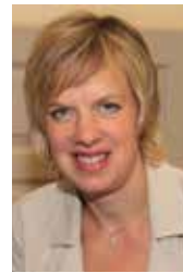
Ivana Bacik Teachta Dála