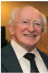
Michael D. Higgins President of Ireland