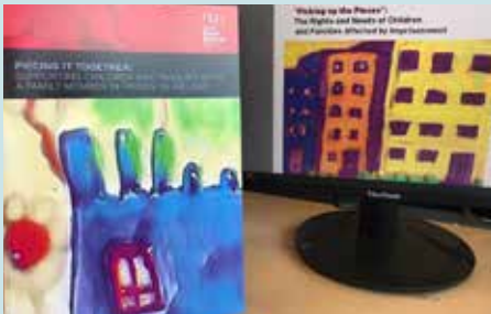
1 Piecing it Together: Supporting Children and Families with a Family Member in Prison in Ireland was published on 15 July 2021. (See page 9)