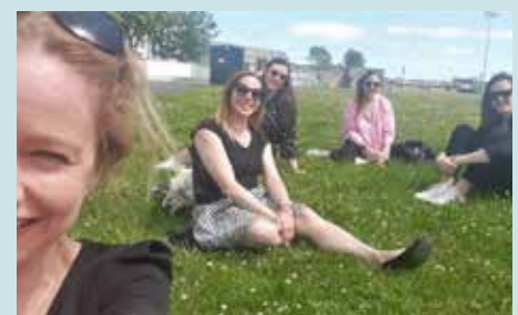
9 The second meeting of the IPRT staff team since pandemic-related restrictions began, June 2021.