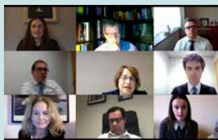
8 All panellists at our Prison Law Seminar on the Prison Rules, February 2021. (See page 19)