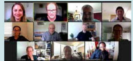
5 Throughout the year, the Steering Group for the Access to Rights and Justice Project has continued to meet remotely.