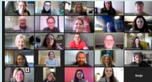
2 Members of the Action for Children and Families of Prisoners at the third network meeting, March 2021. (See page 9)